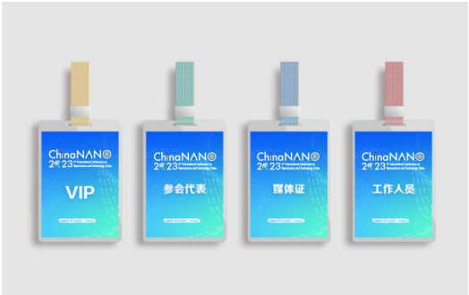
Representation Card and Lanyard