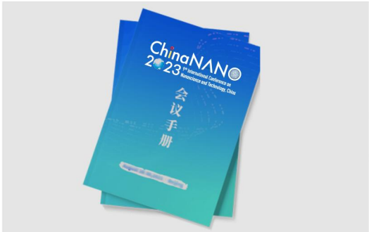
Documents into Pack