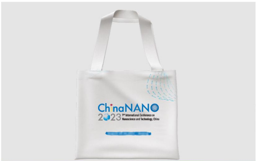
Conference Information Kit