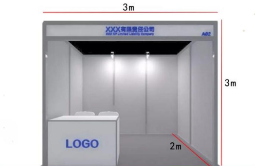
3*2 Standard booth